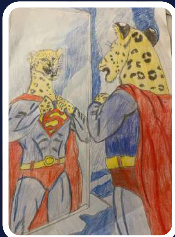
2 nd - Logan & Tyler AKSW