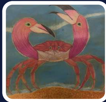
3 rd - Eliza | VJST