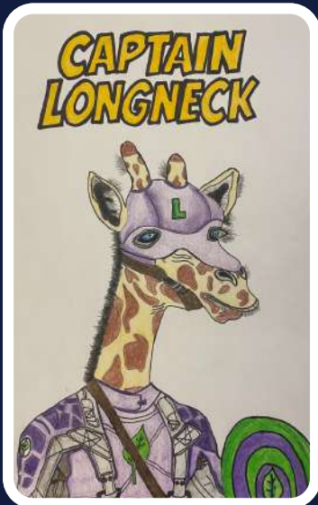
1 st - Lilymae | PWBV